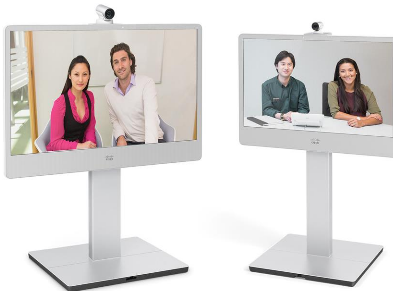
Figure 1. Cisco TelePresence MX300 G2 and MX200 G2

Cisco MX300 G2 and MX200 G2 systems are as easy to install as a television, and can be set up in about 10 minutes. They're priced for large-scale deployment, so you can quickly and easily transform any meeting space into a telepresence-enabled team room. The MX300 G2 with a 55-inch screen is ideal for medium size rooms. The MX200 G2 has a 42-inch screen that makes it ideal for small-to-medium rooms as it has a wide field of view for tight spaces. Both products are easy to use and affordable enough to make video collaboration possible throughout your organization.