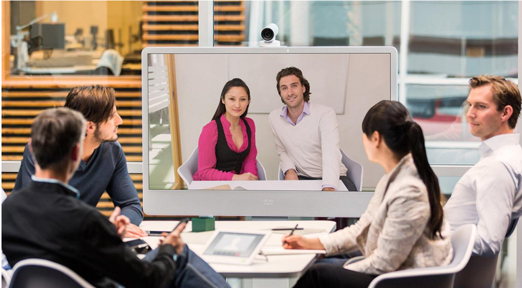
Figure 2. Cisco TelePresence MX300 G2 on Floor Stand

The Cisco TelePresence MX300 G2 and MX200 G2 are part of a complete collaboration ecosystem that offers high-quality, easy-to-use telepresence experiences that you have come to expect from Cisco, together with rapid global service and price-performance that make broad deployment easier and more affordable than ever. Whether you are just getting started with video communications or are planning to video-enable your entire organization, the MX300 G2 and MX200 G2 can meet your needs.