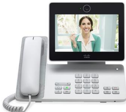
Figure 1. Cisco DX650